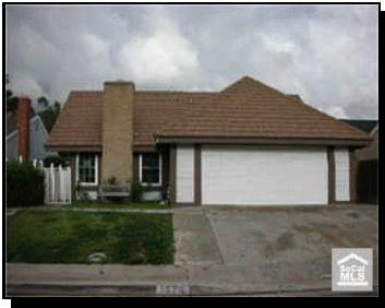
REO - Lender owned.