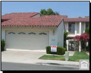
Short sale on the Greenbelt. Nice view, but no boat dock.

Property is Located in the Desirable Lake Forest Keys. It has Lake Views from 6 Different Areas! View the Lake from the Family Room, Dining Room, 2 of the Upstairs Bedrooms, Upstairs Balcony, And Backyard Patio. Crown Moulding Throughout the House. Recessed Lights in Kitchen and Living Room. Marble Fireplace, Recently Installed Ceiling Fans, And 17 Inch Tile in Kitchen, Living Room,