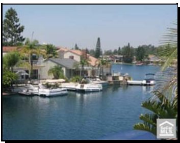
Waterfront - traditional sale

Warm Contemporary Custom Built Waterfront Home. Left 1 Original Wall and Rebuilt.. . Completed in 2003. Smooth Lines, Beautiful Custom Paint and Designer Touches Throughout. Open Floor Plan with Sliding Glass Doors that Stack to Create an Indoor/Outdoor Environment. One of the Best Locations on the Lake! Perfect View of the Spectacular 4th of July Fireworks Show, Launched off The