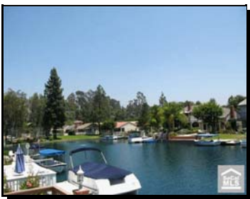
Waterfront - traditional sale.

Absolutely Gorgeous, Spacious, Open and Bright Only Six Homes Away from the Lake, Gorgeous View of the Lake from the Master Bedroom Balcony and Back Yard, Home Backs to a Gorgeous Green Belt, Feels like Your Own Back Yard. 4 Bedrooms, Bedroom Downstairs is Used As a Den, Upstairs Loft/Bonus Room, Formal Living and Dining Room, Family Room w/Breakfast Nook, Dual Fire Place, All New Windows, Double