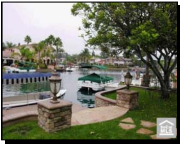
Waterfront. Very cute house! Traditional sale. Came out to $507/sq ft! This was the highest sale in Lake Forest in March 2009.

Hurry! Equity Seller, Bright and Cheerful Darling Cottage Home on Park like Greenbelt. No Lawnmower Needed! Assoc Takes Care of the Front and Back Yards. Lowest Priced Home in the Lake Forest Keys! Beautiful Greenbelt Location on a Private Cds Street. 3Bed/2Ba Open Floor Plan with New Carpet, New Shutters, New Stove, Newer Concrete Roof, Granite Kitchen and Baths. Inside Laundry, New