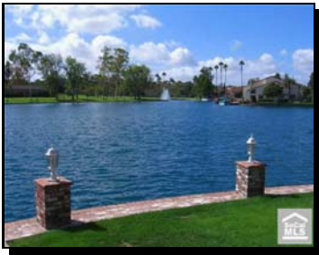
Has been in escrow since 6/03/08. This is a point home, last sold for $1.5million. I keep checking, but it has not closed yet.

Fabulous Location - End of Cul-De-Sac - Right Next to the Lake. Huge Huge Huge Yard!! Only a 2 Minute Walk to the Sun and Sail Club for Swimming, Tennis, Basketball, Gym, Clubhouse, Etc Etc Etc - Resort Style Living At a Killer Price - Tons and Tons of Upgrades Inside.