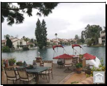
Waterfront - traditional sale

The Best Main Channel View on the Widest Part of the Lake! Don't Miss this Steel of the Year! Owner Must Sell Fast and has Priced the Home Below Existing Comps. Large Patio and Dock Allow for Complete Enjoyment of the Lake and Sunsets. Capture the Views from Downstairs and Your Master Suite. 3 Large Secondary Bedrooms Give Each Family Member Plenty of Space. This is Truly the Buy You Have