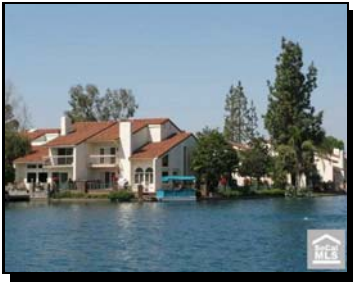
Point home! Traditional sale, but has been tenant occupied for last year.

Address: 22032 Arrowhead Lane Active 3/17/2009