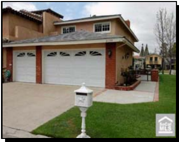
Short sale. Now tenant occupied.

Address: 21799 Ticonderoga Lane Backup Offer 2/26/2009