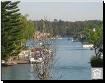
Short sale. NOT on the waterfront.

Address: 24191 Okeechobee Lane Active 3/14/2009