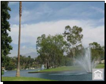
Now a short sale. Waterfront, main channel on wide part of lake.

Fabulous Waterfront Home. 3 Bedrm, 2.5 Baths, Two Stories with Great Add on Potential. Large Backyard with Panoramic View of the Lake, Greenbelt and Private Dock! Newer Remodeled Kitchen with top of the Line Appliances. Tile Countertops, Slate Flooring, Newer Double Paned Windows. This Home Sits on One of the Nicest Streets on the Lake and That's What Makes it a Must See! Sun and Sail Club