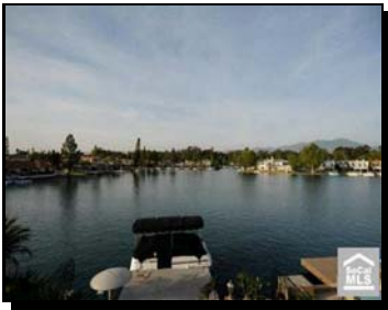
Waterfront - main channel!

Cape Cod Home on the Main Channel of the Lake. 4th of July Celebration is Right Out Your Patio Door, The Fireworks are Spectacular and the Display of Fireworks are Right there for You and Your Family to Enjoy. This Home has Been Totally Redone with a Brand New Kitchen with Marble Counters and Island Sink. Frontroom has a Built-In Entertainment Center with Book Shelves. Hardwood