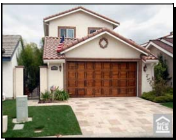
Traditional sale. This home was completely rebuilt in 2007.

Wake Up Each Morning to Beautiful Sunrises Over the Lake and Saddleback Mt. This Property has the Best View of the Widest Part of the Lake. Newly Remodeled Kitchen with Granite Countertops and Stainless Appliances. Crown Molding Throughout, Texcote Paint, Large in Ground Spa, Private Trex Boat Dock, Covered Waterfront Patio. Sensuous Master Bath with Spa Tub and Large Master Suite with Glass