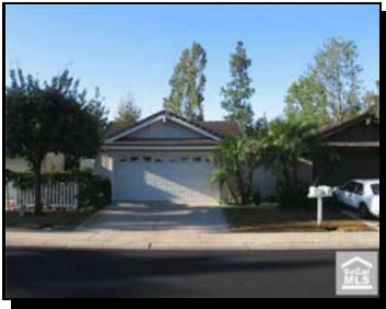
Traditional sale. Home is on the greenbelt.

Address: 24218 Ontario Lane Sold 1/14/2009