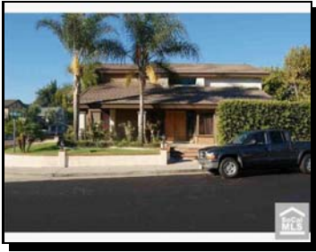
Short sale - erroneously reported as closed in April - last sale was for $860K in July 2006.

Upgraded Home At the End of a Cul-De-Sac! Flag Lot and Spacious Tri-Level Floor Plan with Vaulted Ceilings. Double Door Entry, Newer Windows and French Doors. Wood Floors and a Large Yard with a Pool and Spa. Family Room with Wood Burning Fireplcae and Bar. Large Formal Dining Room and Livingroom on Different Levels to Add Ambiance. Low Taxes.. . No Mello Roos. Sun and Sail Club